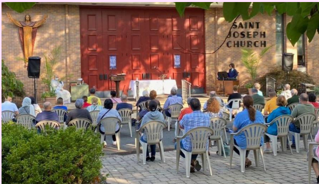
Another great turnout for our outdoor Mass on Labor Day morning! Thanks for joining us!

Examine your energy use. How often do you turn a light on when not needed? Or leave a light on in an empty room? Make a point to only turn on lights and appliances when they are needed and turn them off when you are done. Extra credit: unplug any lights or appliances that don't get regular use.